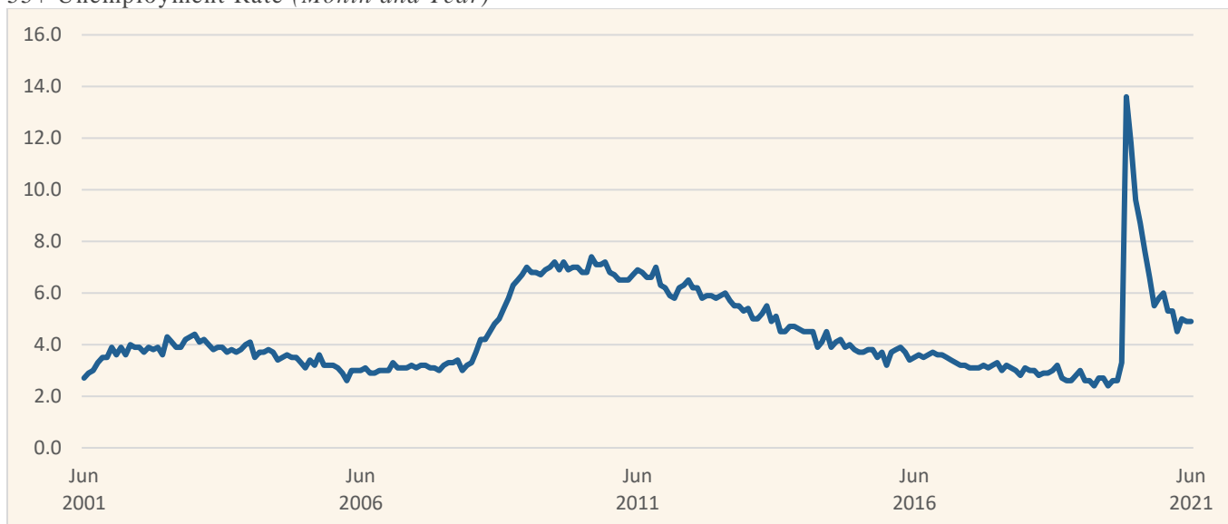
Figure 1 55+ Unemployment Rate ( Month and Year )