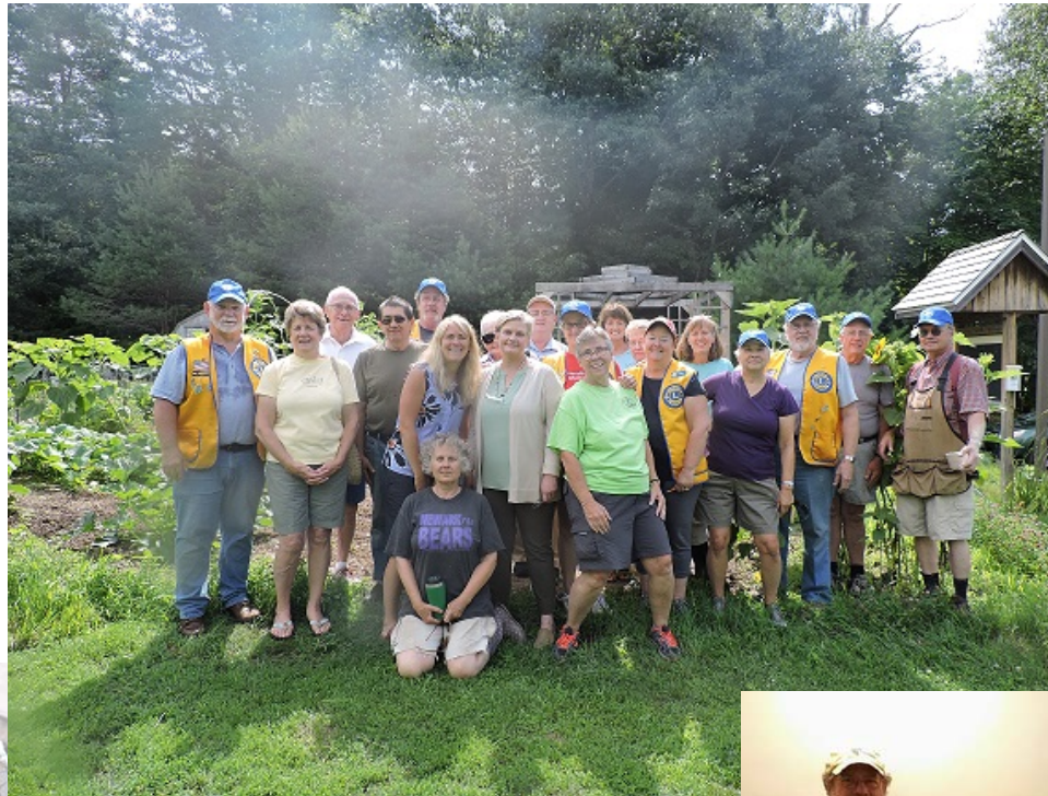
Community Engagement! Our Volunteers!