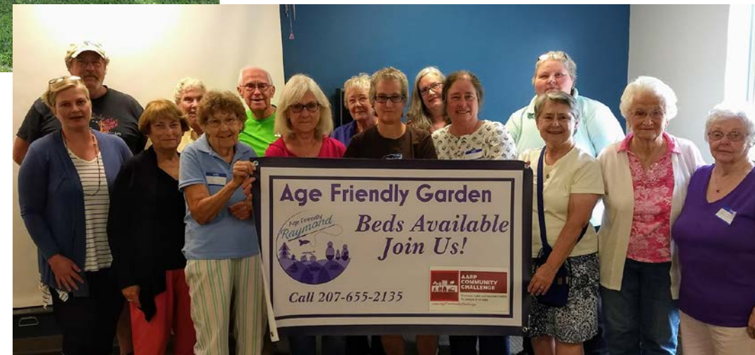
Our Age Friendly Team!