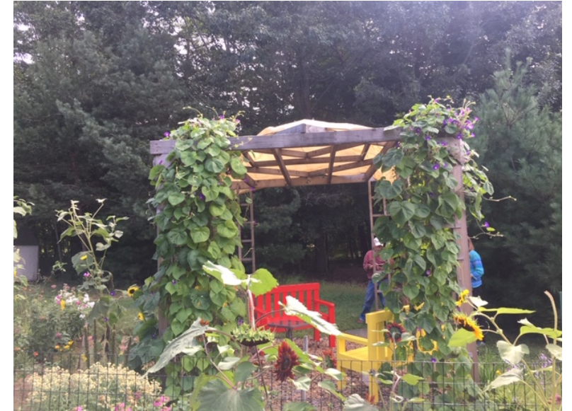
Shade covered gazebo with Benches