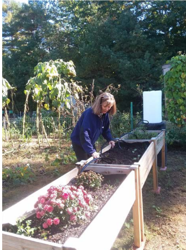
Rain barrel drip irrigation Waist high beds Adaptive tools