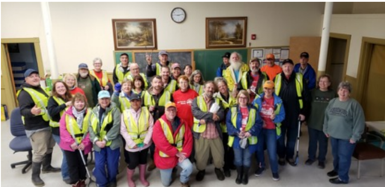
2019 Earth Day Volunteers