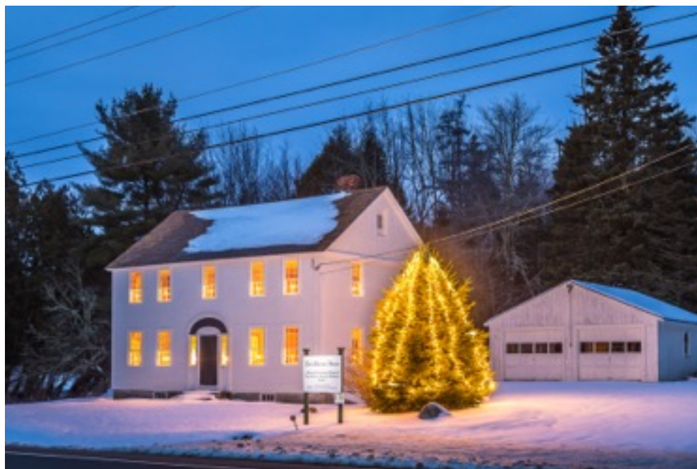
Urann House (circa 1800), US Route 1, owned by the Sullivan-Sorrento Historical Society

OUTCOME: As we assessed transportation needs, AFS identified several individuals who needed rides to pick up their monthly food boxes. Instead of arranging several round-trip rides, we decided to deliver boxes directly to those eligible. We began with four individuals in Sullivan, and expanded delivery to 3 in Hancock & 3 in Sorrento. 2 Franklin residents pick up their boxes from the Sullivan Town Office, as that is a shorter trip than the regional Ellsworth delivery/pickup site.